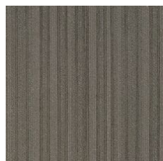
Seam 64761 LRV 8.9