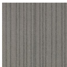
Verge 64555 LRV 11.7