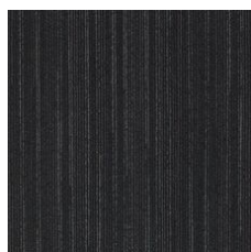
Brink 64505 LRV 2.4