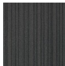
Fringe 64585 LRV 4.5